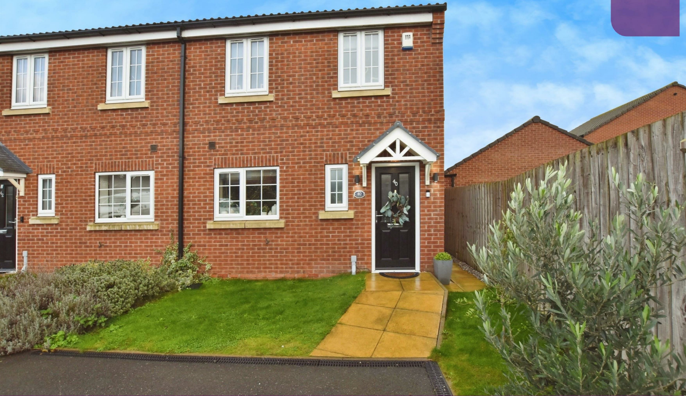
40 Unwin Road, Sutton-In-Ashfield, NG17 4HN £209,950